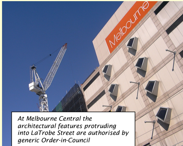
At Melbourne Central the architectural features protruding into LaTrobe Street are authorised by generic Order-in-Council