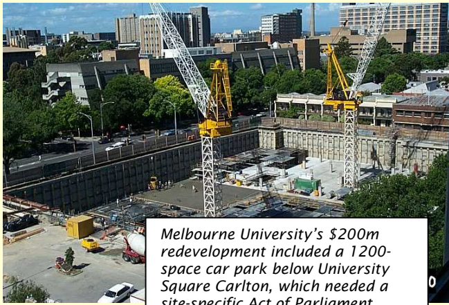
Melbourne University's $200m redevelopment included a 1200-space car park below University Square Carlton, which needed a site-specific Act of Parliament