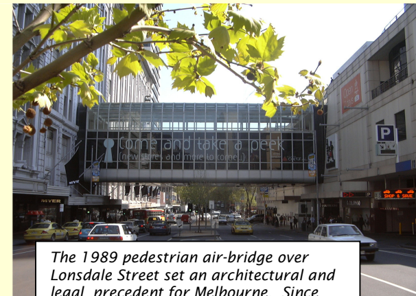
The 1989 pedestrian air-bridge over Lonsdale Street set an architectural and legal precedent for Melbourne. Since then, the law relating to over- and underpasses has gone through some notable changes.

We can tell you whether you need a letter from the local council, a lease from a government Minister, or a new Act of Parliament – and then we can help you through the process of obtaining it.