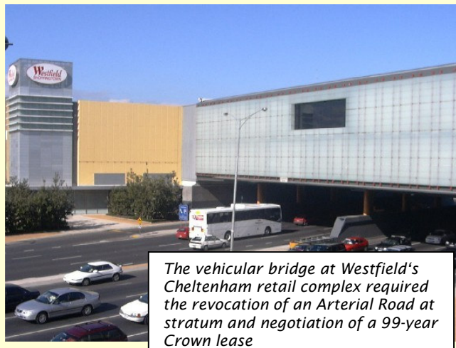
The vehicular bridge at Westfield's Cheltenham retail complex required the revocation of an Arterial Road at stratum and negotiation of a 99-year Crown lease