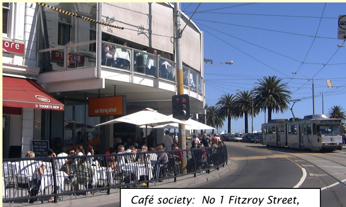
Café society: No 1 Fitzroy Street, St Kilda occupies government road at two strata - each of which needs its own form of legal authorisation

Your freehold title is familiar territory, but there is often a need to step across the title boundary. Over there you will find roads and lanes, railway land, parks and reserves, river frontages and foreshores. Utilising this land needs innovative design and careful planning – but it also needs highly specialised property expertise.