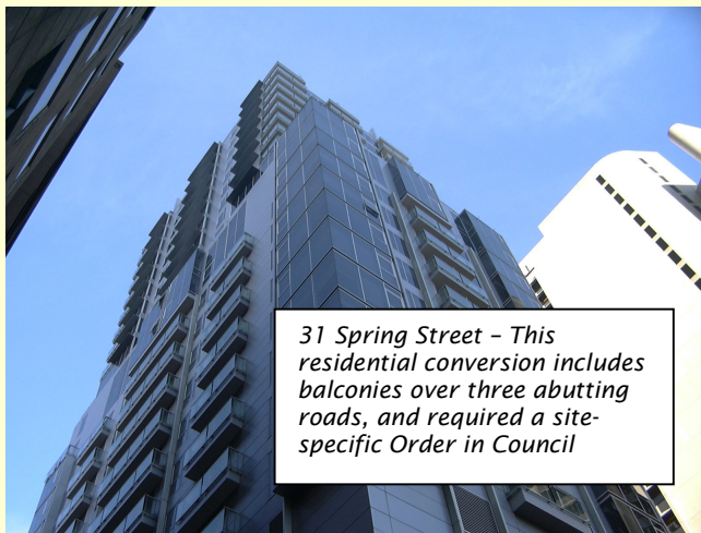
31 Spring Street – This residential conversion includes balconies over three abutting roads, and required a site-specific Order in Council